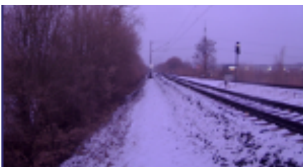
FlatMesh® Camera providing clear images 24/7

Due to Senceive's pedigree in providing monitoring solutions for both slopes and track bed within the rail industry throughout Europe and beyond, Deutsche Bahn selected Senceive's FlatMesh® system to monitor at-risk areas once the fissure had been filled in. This smart wireless system can be easily deployed in a matter of hours and allows the rail maintainer to see the relationship between slope and track.